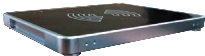
[ Bottom ]