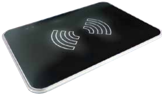
[ Bottom ]